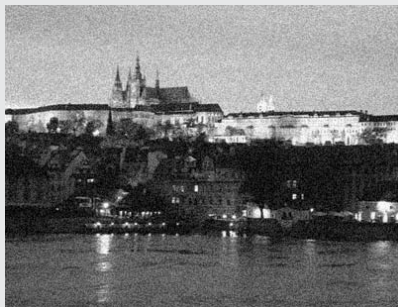
● DNR OFF