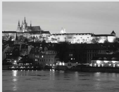
● DNR ON