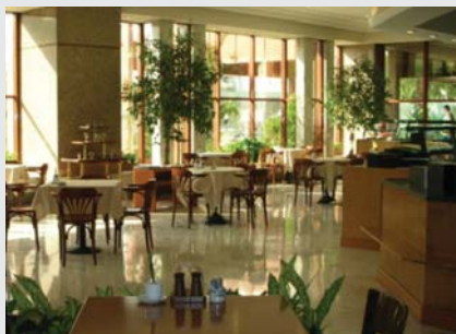
● Conventional Camera