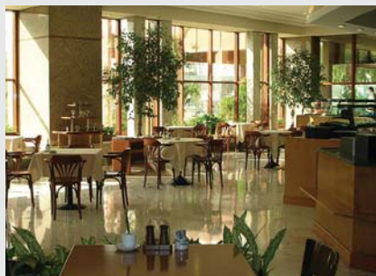
● HQ Series

The new 1/3" Sony HQ1 cameras are featuring the latest Sony HQ1 chipset. It produces sharper and clearer image than other general color cameras.